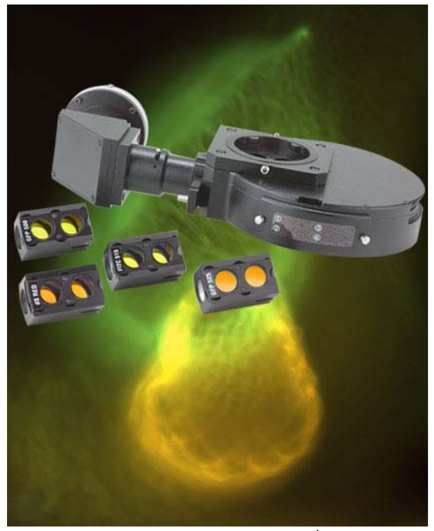
WT48H Embryonic Zebra Fish Heart*