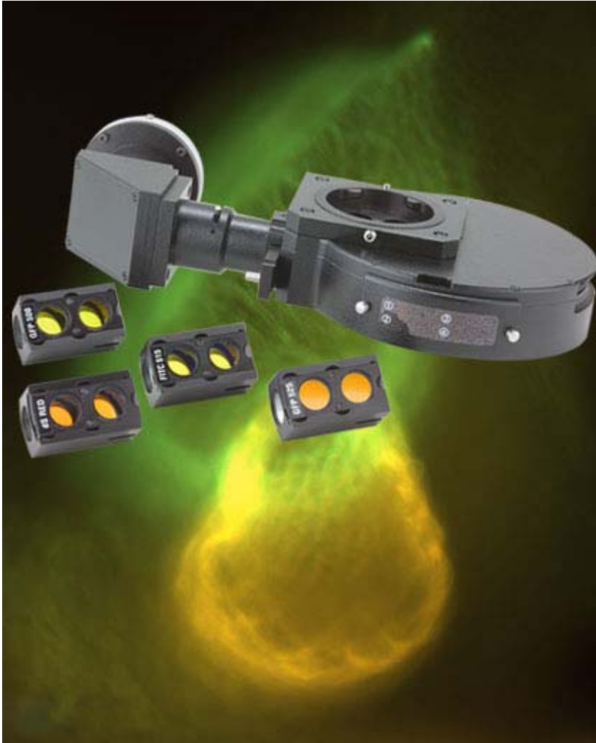
WT48H Embryonic Zebra Fish Heart*