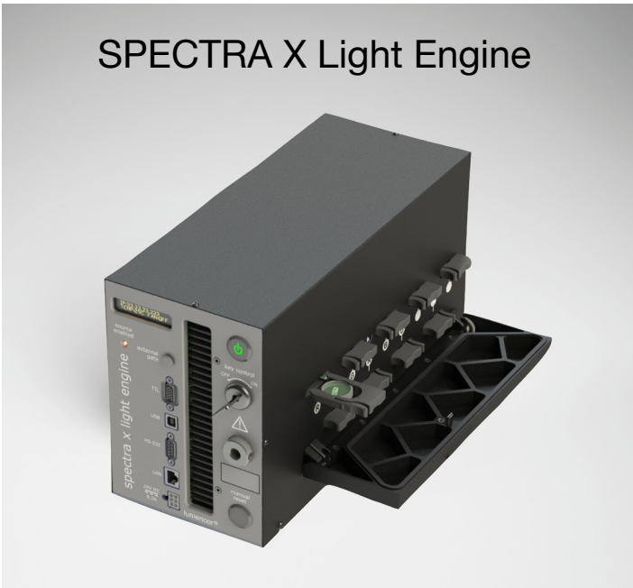
SPECTRA X Light Engine